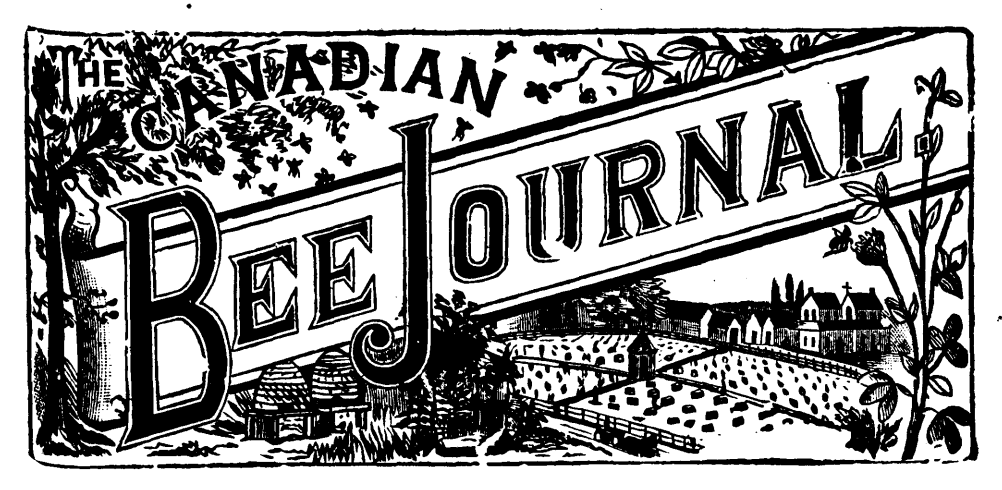
"The Greatest Possible Good to the Greatest Possible Number."

VOL VIII. No. 15. BEETON, ONT., NOV. I, 1892. WHOLE No. 323