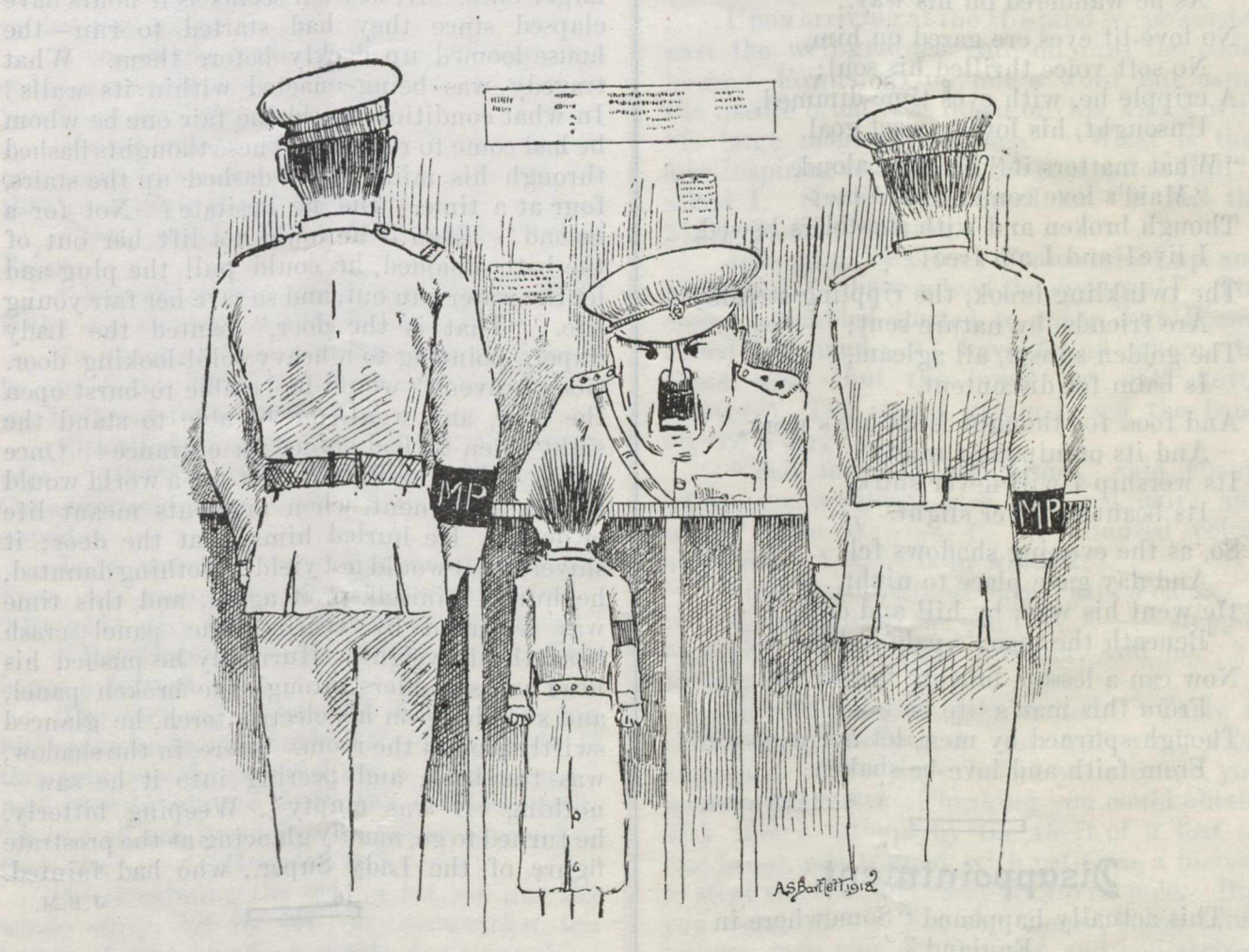
That "Orderly Room" Feeling.

. 19 ton tred Petneof His wiley vin He at