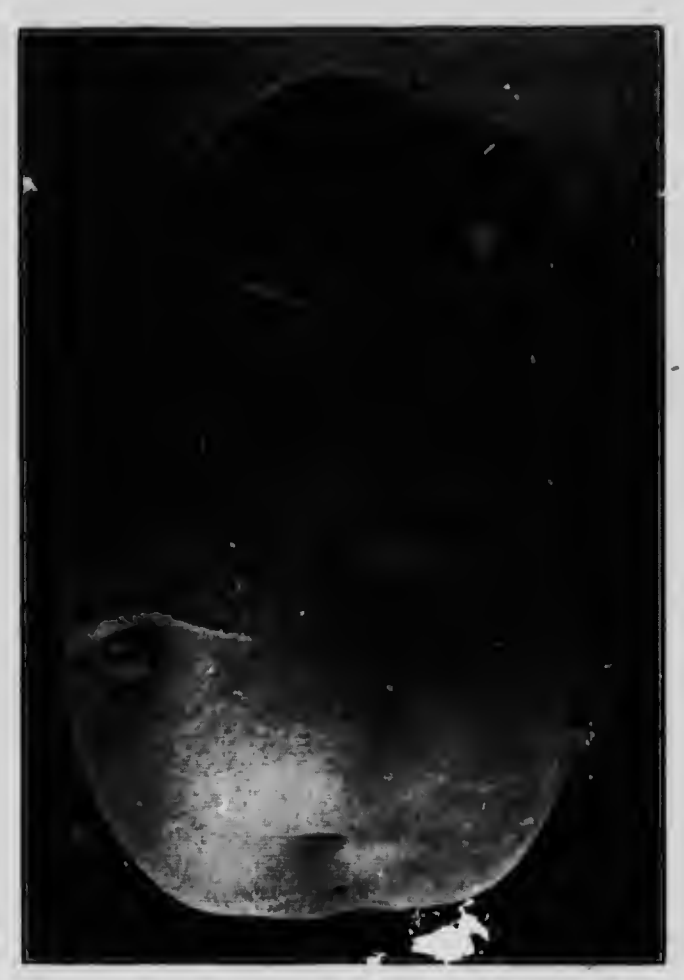
\label{eq:} \mbox{$\Lambda$ good type of potato.}