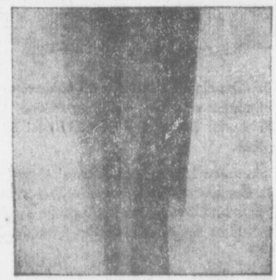
X-ray photo showing Broken Bone of the Leg.

interesting procedure, is carried out by concentrating the light, rich in the violet or chemical rays, from an arc light upon the seat of pain. Sufferers from neuralgia, sciatica, rheumatism,