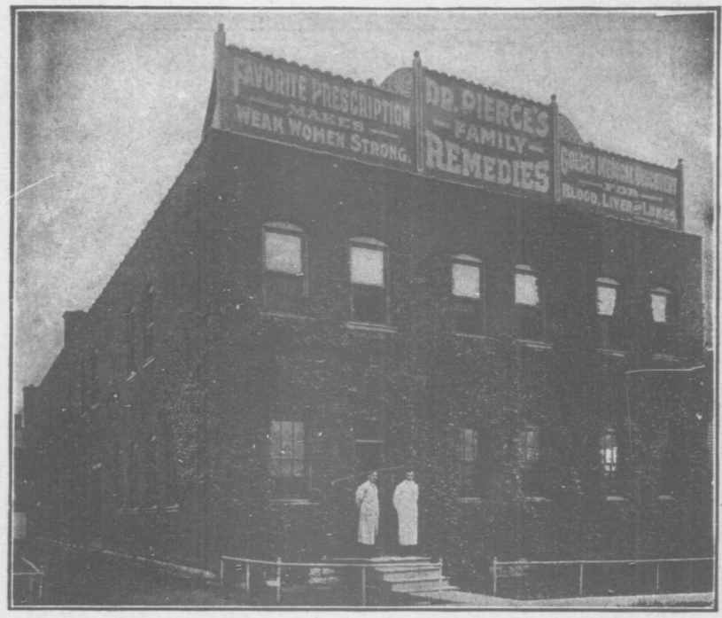
Canadian Laboratory, World's Dispensary Medical Association, Bridgeburg, Ont.