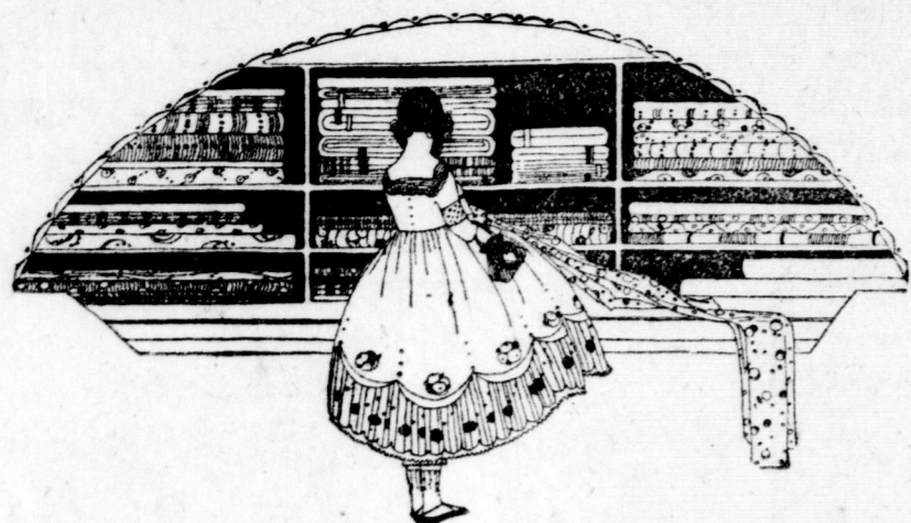
Print Bungalow Aprons, 85c

Print Bungalow Aprons, in medium and light colors. Special fit and finish. Each 85c