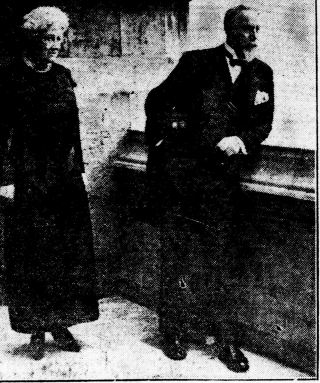
Former Speaker of the British House of Commons, Right Hon. J. W. Lowther, and his wife, taking a farewell look at the Thames from the terrace of the House. There were many touching scenes when he made his decision to resign, having been Speaker since 1905.