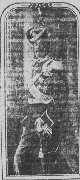
GRAND DUKE NICHOLAS The Grand Duke Nicholas, who by an Imperial decree named by the Czar on August 3, became Commander in Chief of the Russian Army, was born in Petrograd in November, 1858. He was formerly a general of cavalry and military commander of the Petrograd district. He has had a brilliant career in the Russian army and has done much to make it the finest fighting machine which it is now admitted to be. The Grand Duke is a man of splendid physique, with great energy and determination. He has all the instincts of a born cavalry leader and is thoroughly liked by the whole army.