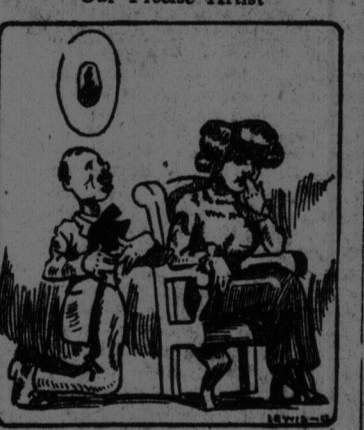
Developing a negative