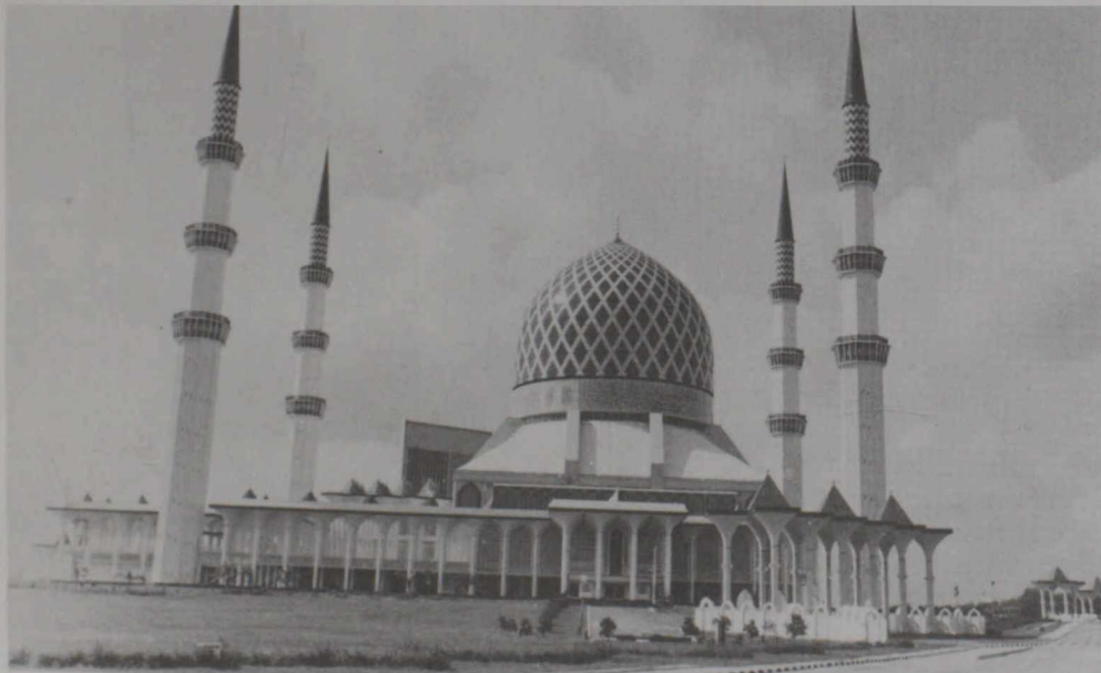
The attractive dome on the new Shah Alam Mosque was built using Canadian Triodetic technology.

One RMP officer is attending the Executive Development course at RCMP headquarters in Ottawa, while the others are receiving specialized narcotics training in Vancouver.