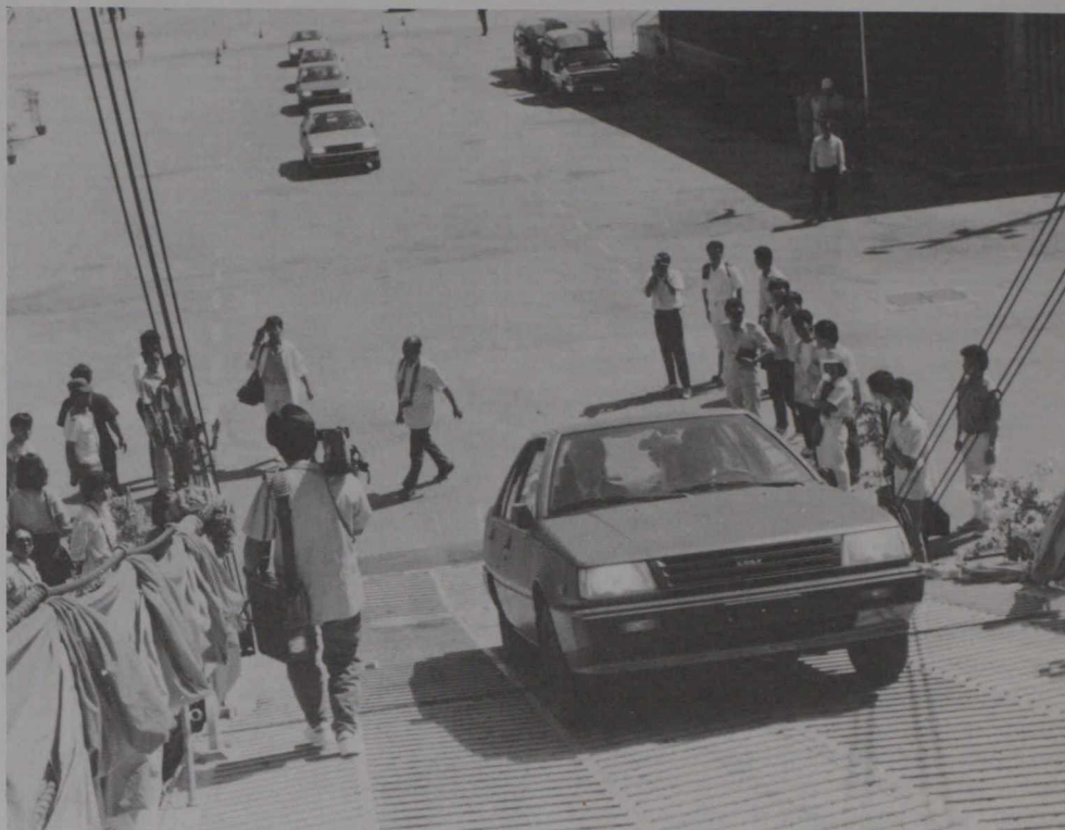
All Aboard! — The first of 420, fully Thai-assembled cars being driven onto a ship bound for Canada.

CCL expects the Lancer Champ to be highly competitive in the Canadian market and talks are already under way to extend the contract to 10 years.