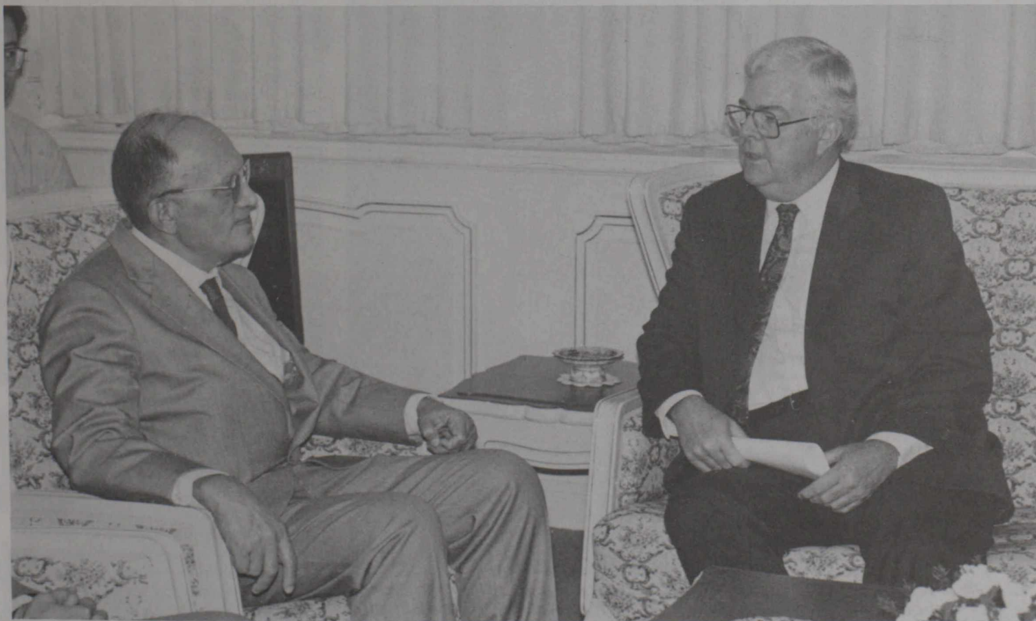
The Honourable John Crosbie (right) meeting with Thai Foreign Minister Siddhi Savetsila.

Minister Crosbie also visited the Fisheries Media Development Centre at Khon Kaen, a project supported by the Canadian International Development Agency.