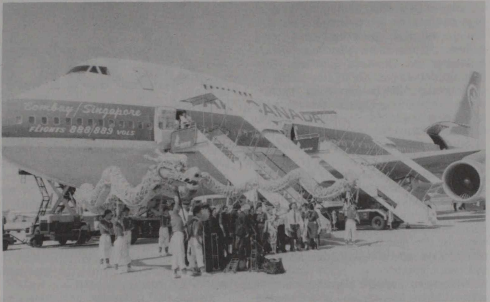
A 22-metre dragon welcomed Air Canada's first 747 Combi-AC 888 — into Singapore.