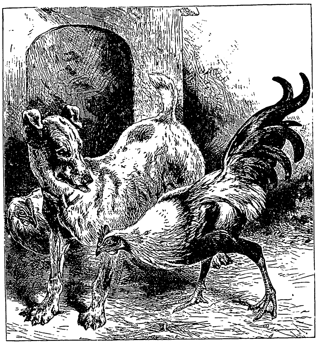
THE FOWLS IN COMPANY WITH THE DOG.