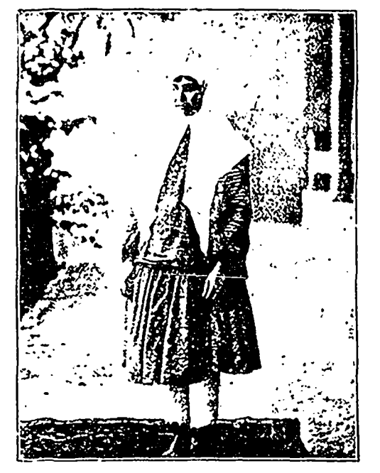
PERSIAN WOMAN IN HOUSE-DRESS.

dyed by native dyes to the most vivid crimson, green, or blue. I visited one such village last autumn. It was off the regular caravan route, and had neither post-house nor caravanserai (inn) where I could spend the night. On making enquiries I was told of one person who, they said, had an empty room, which he would let me have as soon as he returned from working in his garden. In the meantime his womenkind asked me to come and wait in their part of the house. I gladly consented, as with only a brief stop for luncheon, I had been on horseback for nine hours. Entering the small courtyard, with doors opening from it on all sides, was like entering a rabbit-warren. At first there was a general scuttle of women and children into their respective quarters; then a gradual return, as curiosity overcame fear. Atter that, the questions with which every Persian visit begins-"How old are you?" "Have you a husband?" "Why not?" "Your father and mother, are they alive?" "Are not your ears cold without a covering?" "Why have you come to this country?