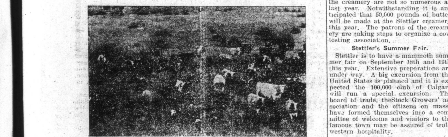
Export Cattle, Grass Fed and Grass Fattened on a Stettler Ranch.

Stettler is the present terminus of the C.P.R. branch east from Lacombe. It is 50 miles from Lacombe and has a population of 400, 80 places of business and promises to be one of the most important trade centres of central Alberta.