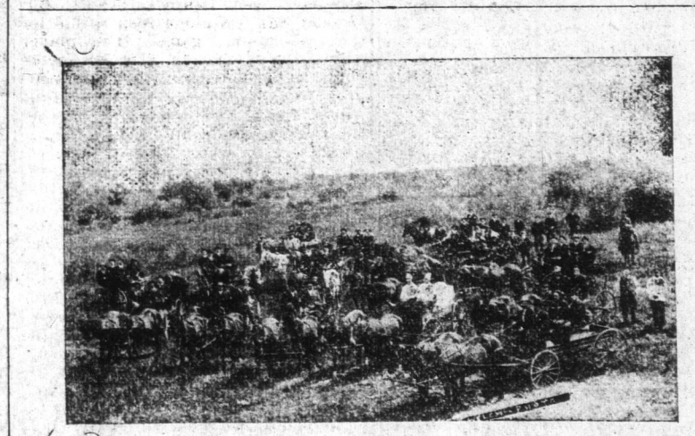
Homesteaders Starting Out to Hunt Land in Stettler District.