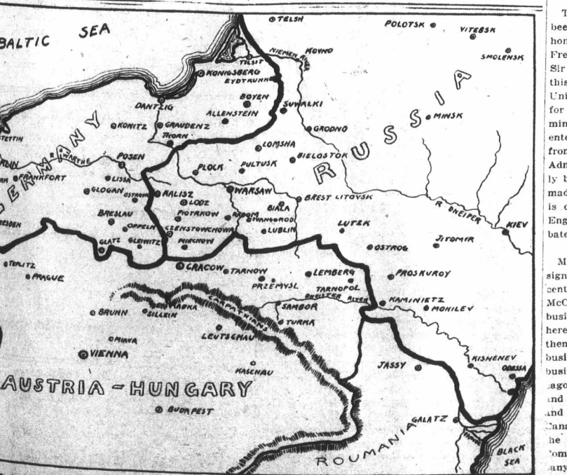
The desperate fighting taking place in Poland, Eastern Prussia and in the Carpathians again focuses attention on Eastern Europe. The crushing defeat inflicted on the Germans in the district north-west of Warsaw is of the utmost importance, and may mean the withdrawal of the German forces from Poland.

Philadelphia, February 6.—Baldwin Locomotive Works has received orders from the French Commission for six locomotives for service in Morocco and three locomotives from Louisiana Railroad and Navigation Company.