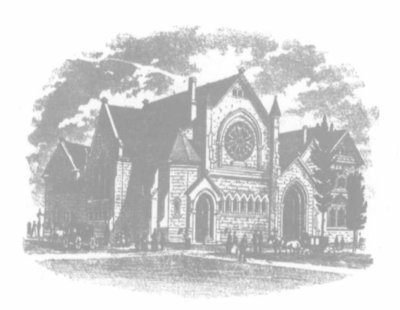
IMMANUEL BAPTIST CHURCH, TORONTO.