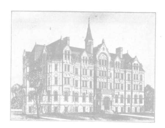
M'MASTER HALL TOPONTO