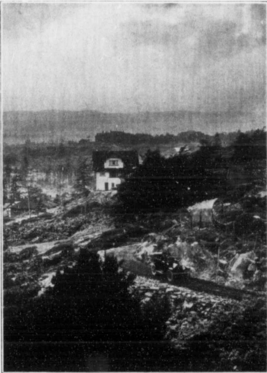
A BIT OF SUBURBAN VICTORIA

The Wonderful International Scenic Auto Tour of the Pacific Northwest