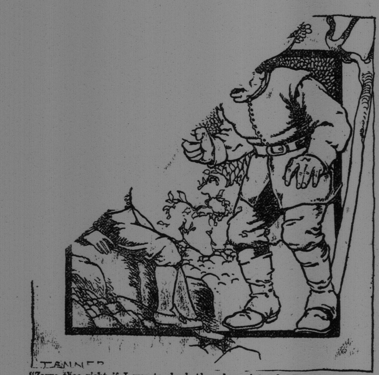
ANSWER TO YESTERDAY'S PUZZLE. Left side down, behind Tinker.