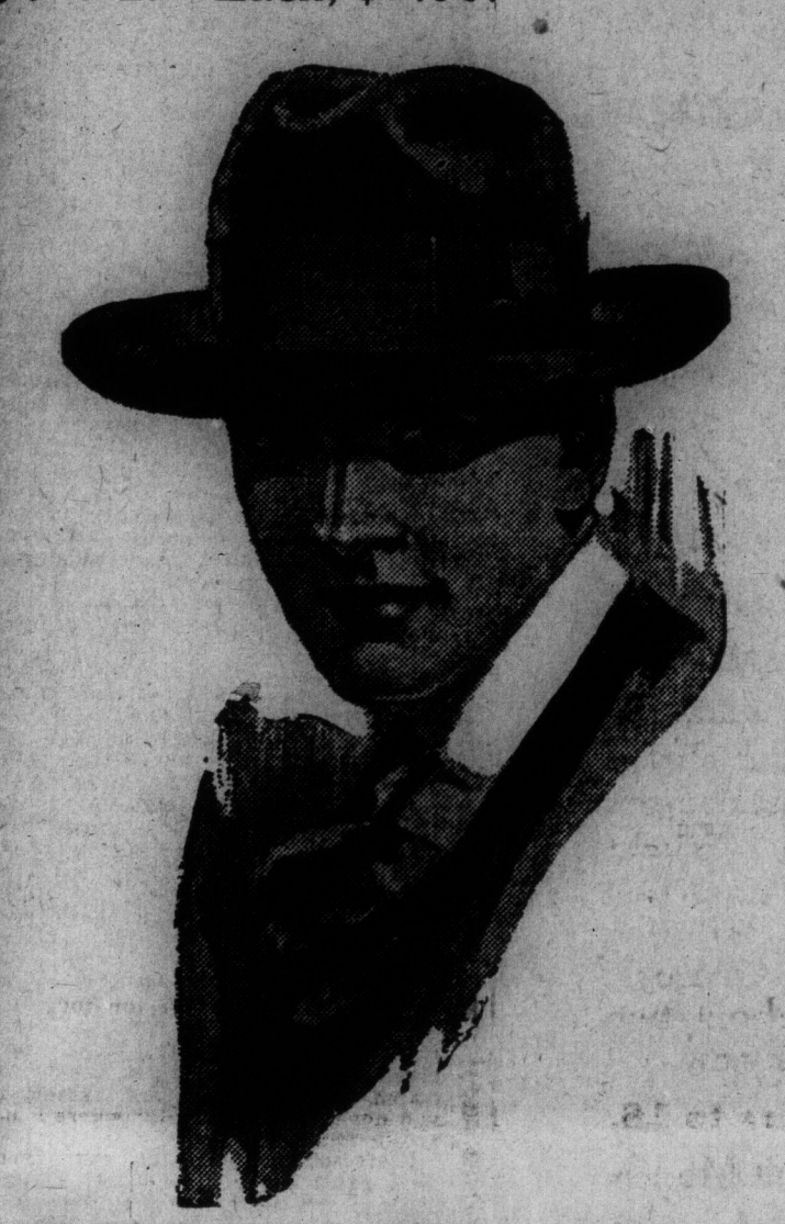
Boys' Hats and Children's Tams

A material that is specially favored for fall and winter wear. These at $5.00 are in the fedora style with crease crowns and brims that are flat or slightly flared, are in shades of green, brown and black. Sizes 6 5-8 to 7 1-2. Each, $5.00.