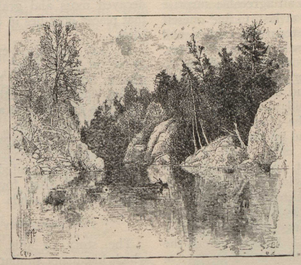
AMONG THE THOUSAND ISLANDS.

On the whole, this great French-Canadian has made us feel more kindly towards the politicians of our day and country, and has laid down a precedence of probity for the men who are to come after. His course has done equal honor to head and heart.