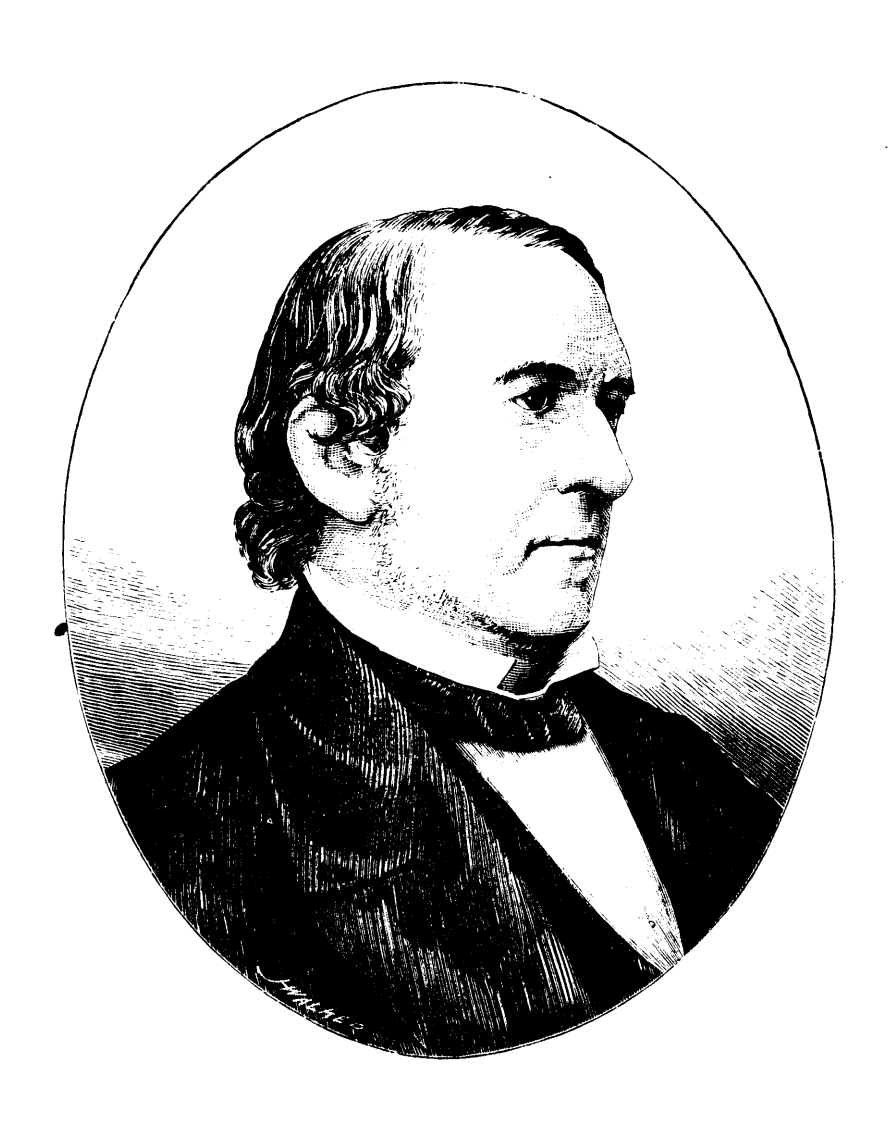
THE RIGHT HON. W. E. GLADSTONE.