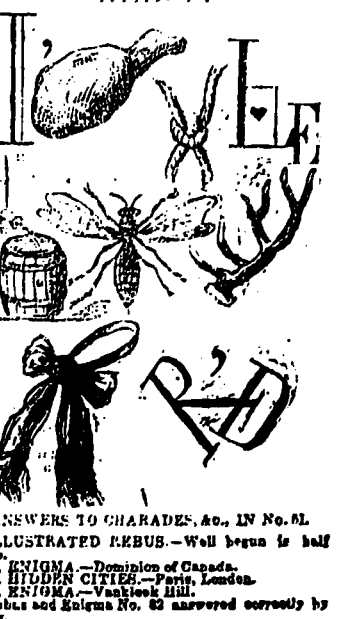
ANSWERS TO CHARADES, No. 61. ILLUSTRATED REBUS—Well begun is half done.