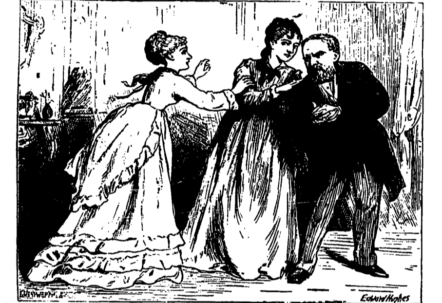
OH! SHE EXCLAIMED, "DON'T SPEAK TO ME! DON'T TOUCH ME!"

"Oh!" she exclaimed. "Don't speak to me! Don't touch me! Let me enjoy it! There is no disappointment here. I have never thought, I have never dreamed, of anything half so beautiful as this!"