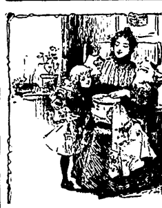
66 RICHELIEU STREET, ST. JOHNS, P.Q.

FILES, GRATES, HEARTHS, MANTELS, RICE LEWIS & SON, (LIMITED), COR. KING & VICTORIA STREETS TORONTO.