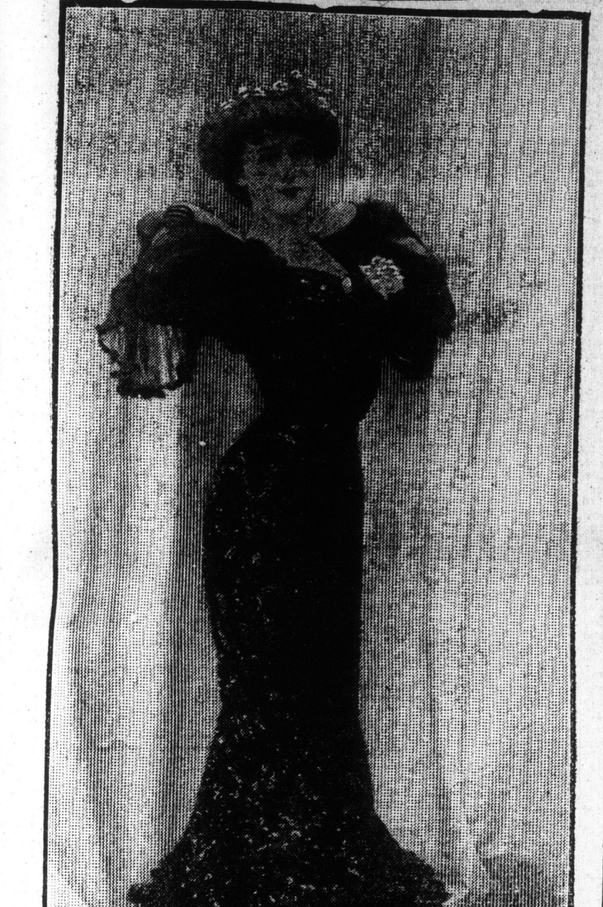
Evening Gown of Chiffon and Lace.

ry Irving ic welcome ight in the he first ap-long-await-y Victorien There was ragement in h which he icant to all pathetic cirappearance