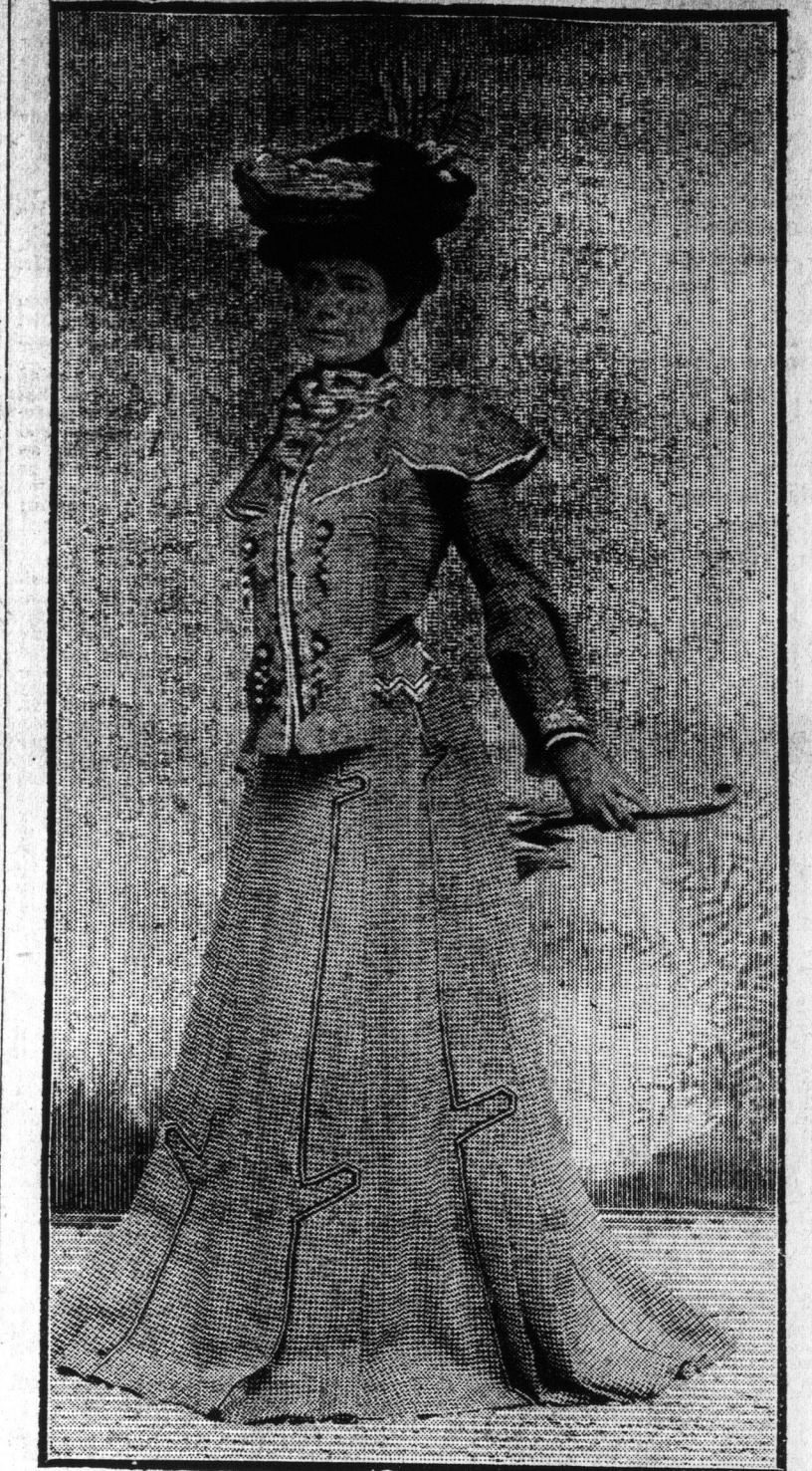
Small Checked Cloth Piped with Black and White Taffeta.