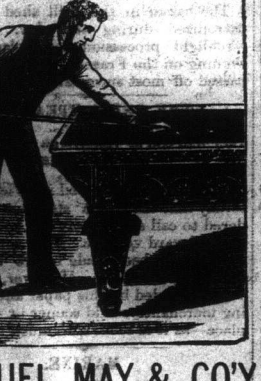
plate. We are the only establishment north of DAMIANA cures Dyspepsia and gives SAMUEL MAY & CO'Y Portland, Or. or West of Winnipeg that per for Sale by LANGLEY & CO., Druggista, and

CALIFORNIA BITTERS PLATE GLASS, PLAIN & FANOY WINDOW GLASS To Order at Short Notice.