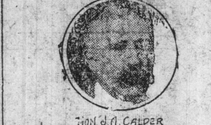
Hon. J. A. Calder, Minister of Immigration and Colonization—who is likely to be placed at the head of the new Department of Public Health for the Dominion.

You are further warned that cutting at a corn is a suicidal habit.