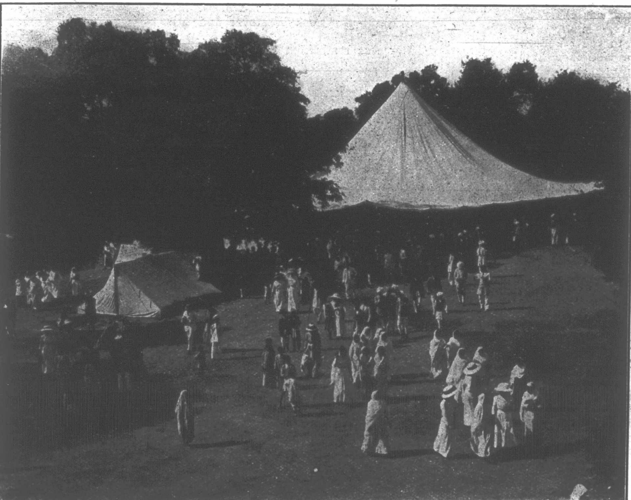
THE SIALKOTE "KESWICK" PUNJAB, INDIA.)