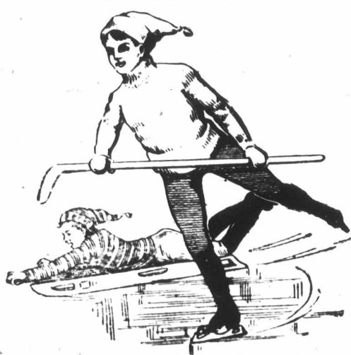
The Brooks Appliance Cured His Rupture. New He Is As Sound And Whole As If He Had Never Been Ruptured.

I want them to know about the Automatic Air Cushion Rupture Appliance that I make for child-ren who are afflicted in this way.