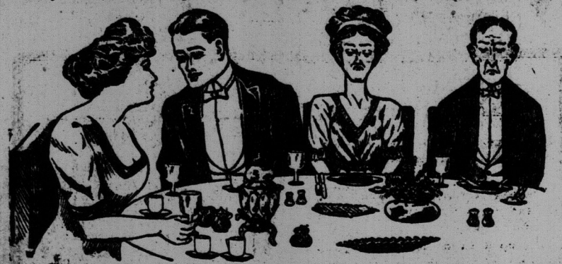
Don't be the "Skeleton at the Feast" Sargol makes Funny, Fevish People Plump and Popular.

We Invite Every Thin Man and Woman Here Every Person in St. John And Vicinity to Get Fat at Our Expense