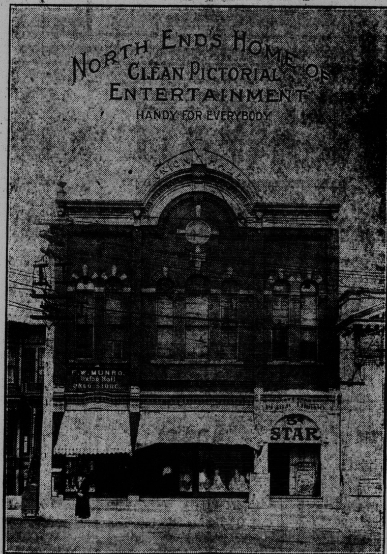
Bring your guests to see our big special programmes.