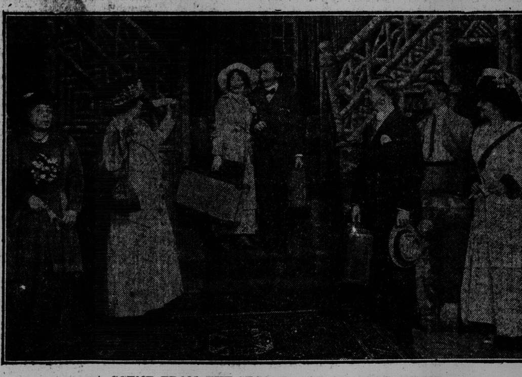
A SCENE FROM THE SECOND ACT OF OVER NIGHT.

There are a few exclusive producing H. Brady, whose productions include such notable successes as Bought and Paid For, Bunty Pulls the Strings, Mother, The Bow, The Man of the Hour, Baby Mine, Way Down East, and sundry other past and present New York hits. It is therefore of more than passing interest to note that one of Mr. Brady's most successful comedy productions, Over Night, will be the attraction at the Opera House starting next Monday, Labor day, matinee and continuing for the week.