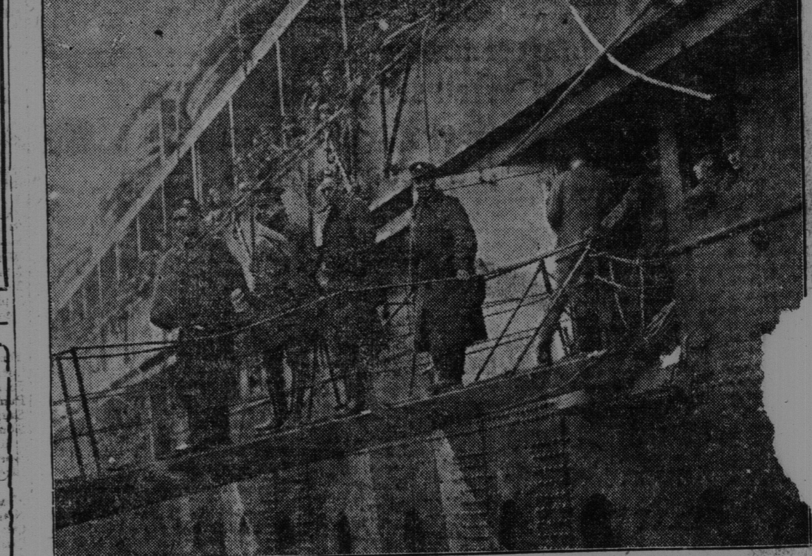
Four Canadian soldiers, who led the way to Canadian soil when the Olympic docked at Halifax. They were the envy of their comrades looking down from the deck—Copyright photograph by British and Colonial Press.