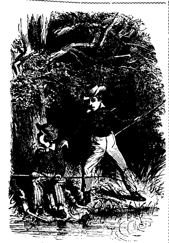
LISTENING TO THE SCHOOL-BELL