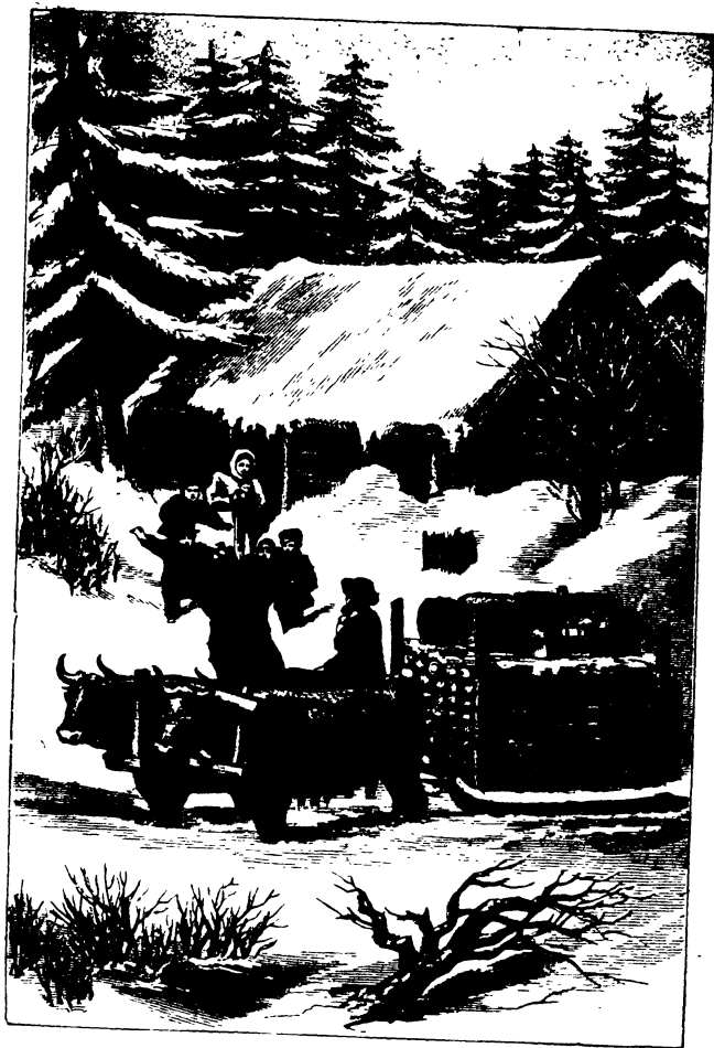
STEPHEN GRATTAN'S FAITH.