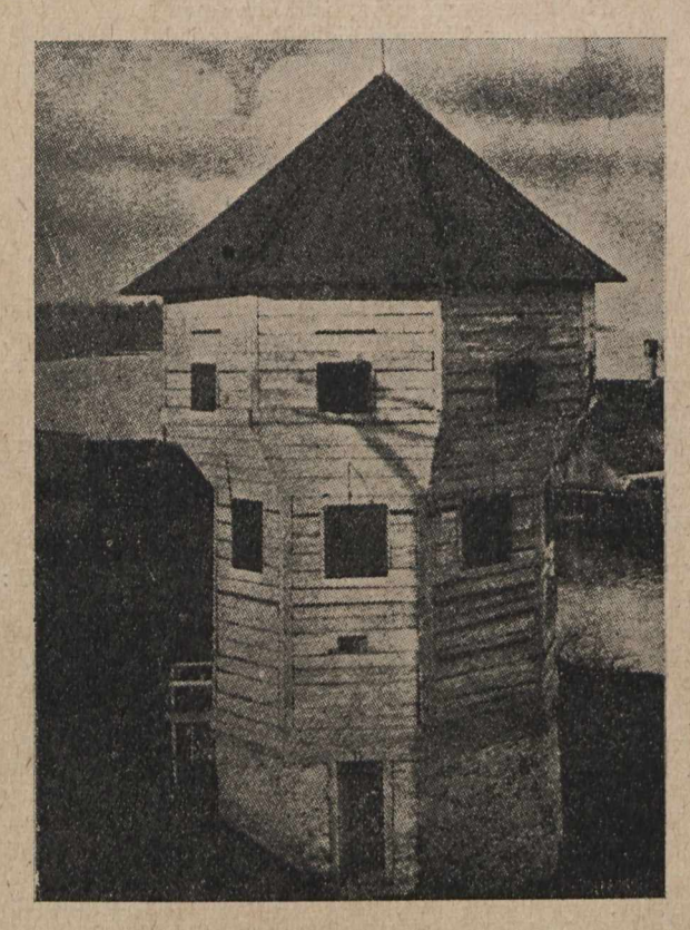
What would a H.-E. do to this?

This old Hudson Bay Fort, situated in Nanaimo, Vancouver Island, B.C., was built in the early pioneer days of the coast. It was used in repelling attacks of the Red Man. Built entirely of hand-hewn timbers, with a rockfoundation, it is situated on a rocky ridge, with a good commanding view of the water, and a small inlet which in those days was the chief landing place, for Indians and white men alike. In case of an uprising of the Red Men, the pioneers living near would take refuge in this fort, and I don't think the occasion is on record, where it has ever been overcome. Some of the old cannon used in it in those days are still on exhibition at Nanaimo. The hoop-holes for these can be seen quite easily, with loopholes for rifles on top or on either side of them. Modern times have failed to erase its bluff appearance, and little