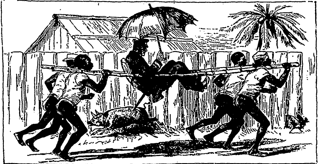
TRAVELLING IN MADAGASCAR.