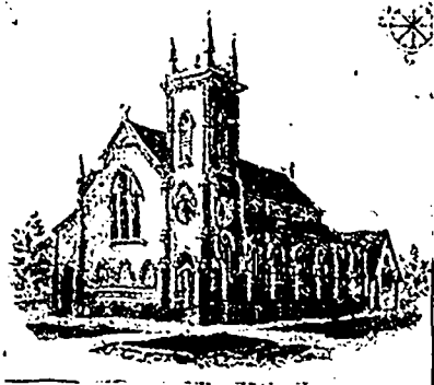
ST. PHILIP'S CHURCH, TORONTO.

three have been laid to rest, awaiting the sound of the trumpet of the archangel of God which shall summon all men from their graves. Let me add that this parish, which began with a congregation of seventy-nine in 1875, has grown to its fair proportions in 1895. Over five hundred names of families appear upon my parish lists, over four hundred persons are actual communicants of the church, and in this period this church has contributed in the neighborhood of $60,000 towards the different objects which from time to time have been brought before your attention. Brethren, you are none the poorer, are you? Nay, is not every one the richer for the gifts which he or she has given in freewill offerings unto God? Sunday after Sunday, every one who has contributed conscientiously, systematically, proportionately as God has blessed him or her, has received corresponding blessings from the 'Giver of every good and perfect gift.'