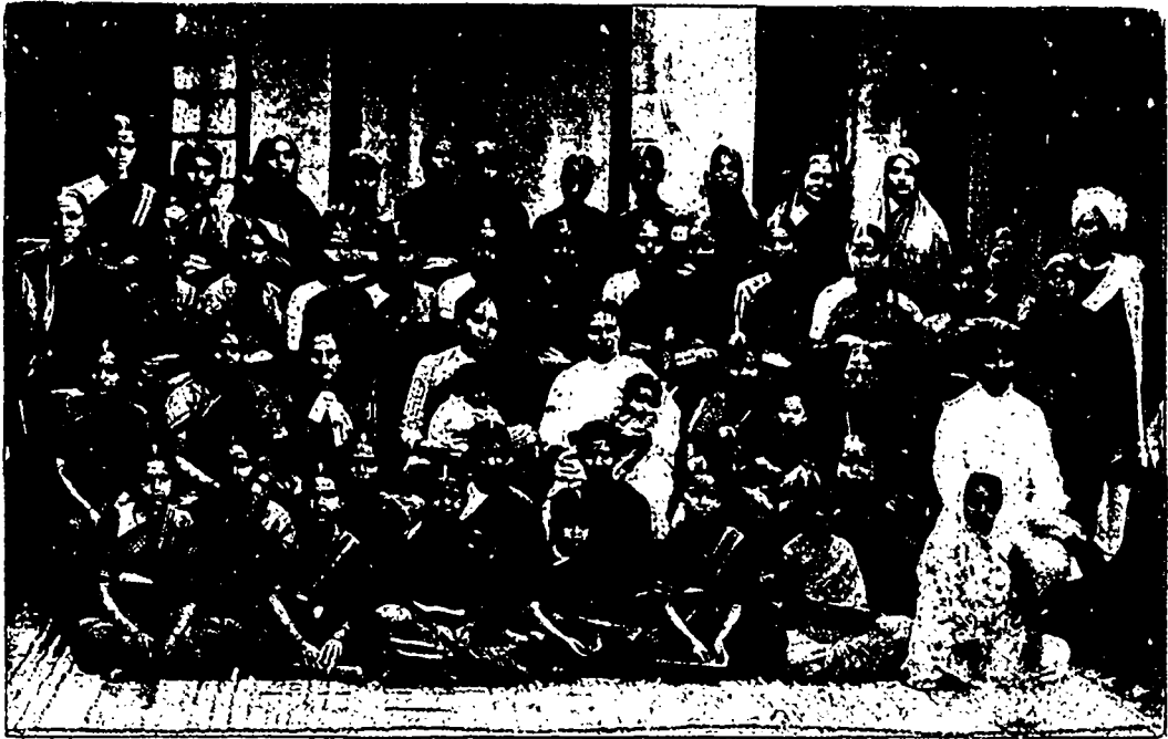
HOME FOR INDIAN WOMEN AT POONA.

not unknown. In the general progress and improvement, however, of this reign, the clergy remained singularly backward and superstitious, though the archbishop himself was the patron of advancement.