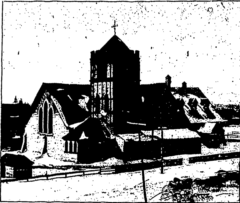
CHRIST CHURCH, WINNIPEG. (See April issue, p. 73.)

appointed him an honorary canon of St. Alban's Cathedral, Toronto.