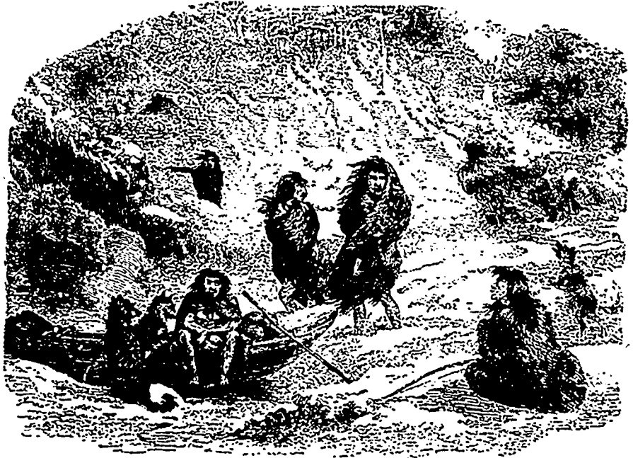
INDIANS OF THE YUKON.

To MAKE some human hearts a little wiser, manfuller, happier, more blessed, less accursed, is a work for a god.