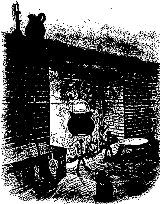
THE PUSSY THAT BUILT THE CHURCH