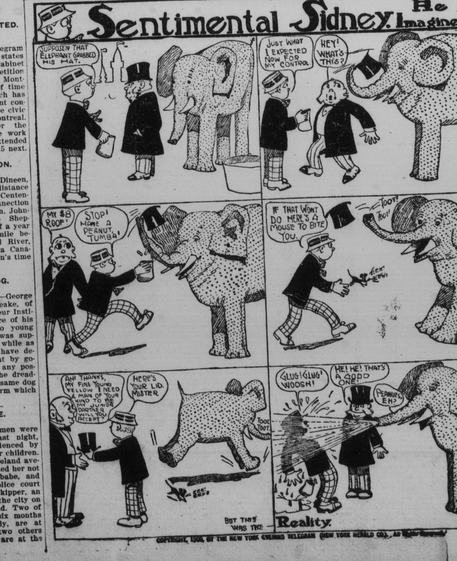
Copyright, 1909, by the New York Evening Telegram (New York Herald Co.), 47 West 43rd Street.