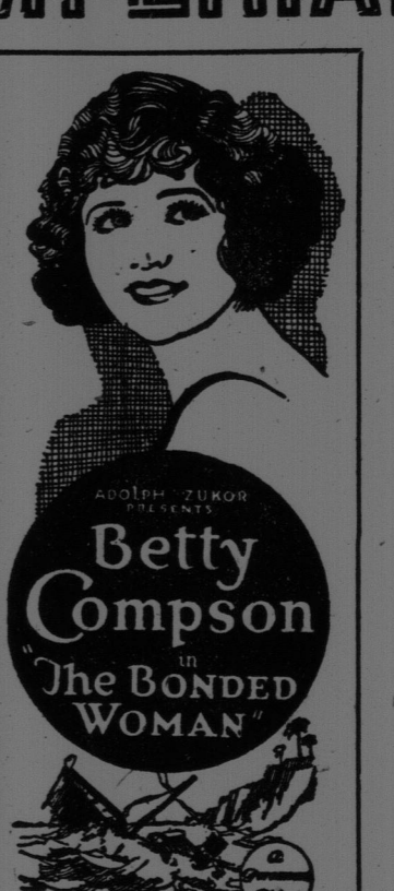
Betty Compson The BONDED WOMAN

ROMANCE — ADVENTURE — BOXING — CARNIVAL — SKATING