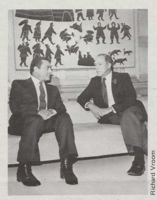
Prime Minister Trudeau (right) speaks with President Mubarak.

opment activities in Egypt and covers all phases of economic, technical and related assistance.