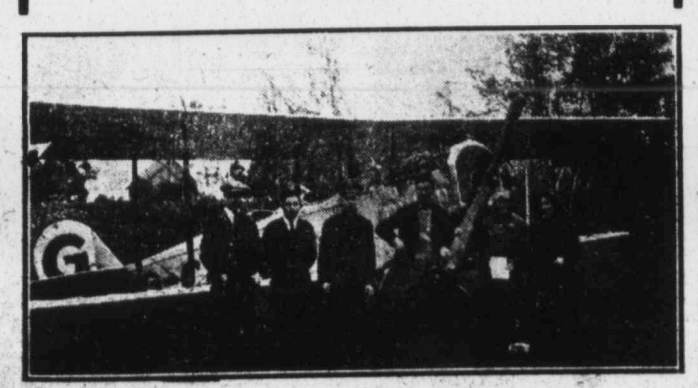
"ANNOUNCEMENTS FROM THE AIR"

Collections on behalf of Local Salvation Army work in connection with Winter Relief