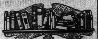
A CODE OF SAVAGERY