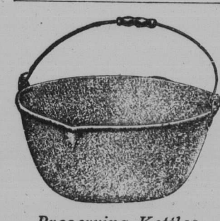
Preserving Kettles We have a big variety

Forks, Rakes, Hoes, Scythes, Swaths, etc — Are the Best on the Market.