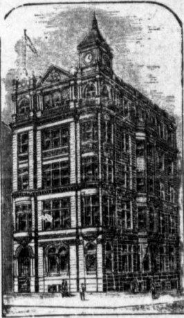
COMPANY'S BUILDING, MONTREAL.