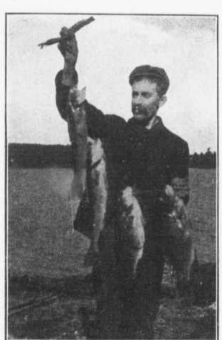
A GOOD CATCH IN LAKE TEMAGAMI

N the most conspicuous place on the most prominent street of this city, there is a very large sign advertising a certain brand of whiskey. It is on the roof of a building so situated that the sign can be seen for many blocks, and thousands of people who have no reason to hang their heads, are compelled to gaze upon a stupid, insipid-looking face and figure of a wooden man, supposed to be preparing a drink of whiskey. The sign is an affront to the moral sense and intelligence of this splendid city. After the words advertising the brand of whiskey, the words "that's all!"