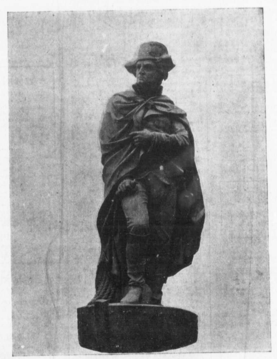
WASHINGTON STATUE, PHILADELPHIA See page 324