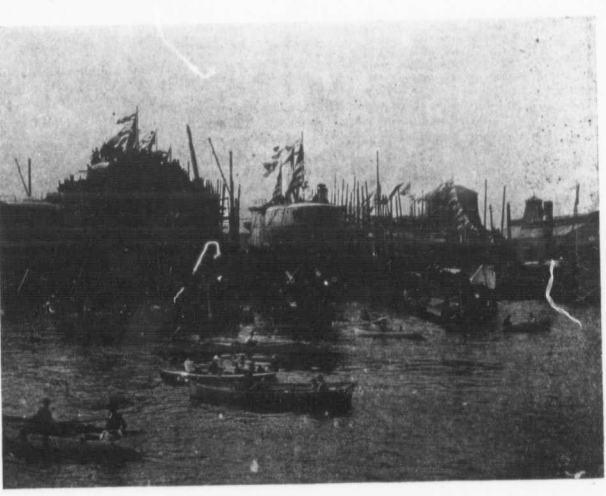
CRAMP'S SHIPYARD, CAMDEN, PHILADELPHIA

[For the fine pictures which accompany this article, we are indebted to Sunshine, a bright little paper published by the Sun Life Assurance