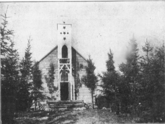
THE INDIAN CHURCH, AT BEAR ISLAND The trees are not natural, but were placed there by the Indians specially for the occasion.

tents and huts of scores of Indians, squaws, children and papooses. They have come varying distances, extending as far as one hundred miles, to be present at the religious feast provided by the annual coming of the Oblat Father, and the unusual visit of the stately Archbishop. Ten years have slipped away since the feet of Le Monseigneur have pressed the soil of this Indian island. Now, as he steps from the steamer, he is received with the obeisance of the good priest, who, kneeling, kisses his Episcopal ring, sign of sacred authority, and symbol of his care for the dusky scattered sheep of the Northern Wilderness. Forewarned and forearmed, instantly, upon the rising of the priest, the Indians gleefully discharge into the upper air a curious collection of musketry; a veritable feu de joie; the salute of the red man's heart to the Power that dwells in the infinite