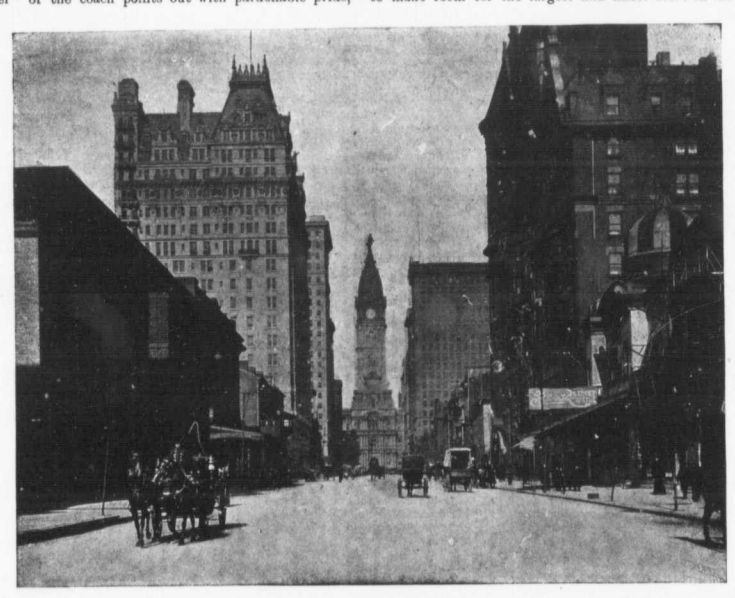
A BIT OF BROAD STREET, PHILADELPHIA The City Hall is seen at the end.

One of the landmarks of the central section is the departmental store of John Wanamaker, which is fast disappearing, to make room for the largest and finest store in the world