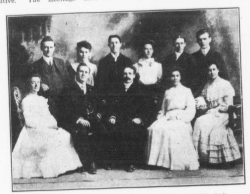
OFFICERS OF MARYLAND ST. EPWORTH LEAGUE, WINNIPEG, MAN

No. 3 may be called active students. taking all advantages and benefits of the school. In the intervening hours, after a moderate recreation, they go to the different tents and cottages and talk with students about their League work, etc. When they go back to their own community they set those things learned in munity they set those things learned in the school into practical operation. What we need in the Summer School is this kind of student. Theory, machine, and method, however excellent they may be, accomplish nothing, but the living force accomplish nothing, but the living force of devout personality is needed. A conviction is dead until it has expressed itself in the practical experience and life.