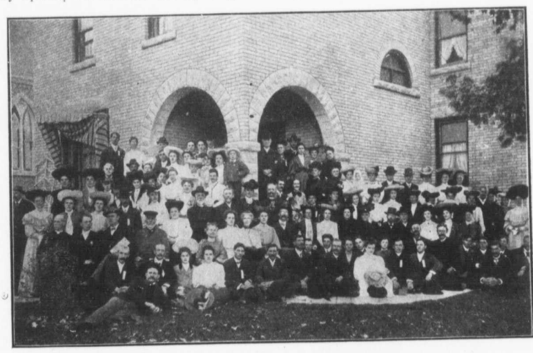
COLLINGWOOD DISTRICT EPWORTH LEAGUE CONVENTION, AT THORNBURY-See p ge 344.

We spoke of fighting. The battles of to day are fought on paper and the hustings. Learn, if possible, to use a pen. Its voice may drown the roar of cannon. Even at great expense of time and labor learn to write what you think in clear, straightforward, nervous Anglo Saxon. It seems strange that