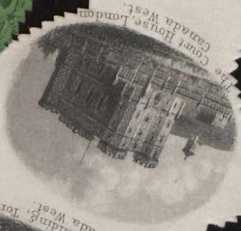
Court House, London, Canada West.