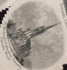
St. Michael's Cathedral, Toronto, Canada West.