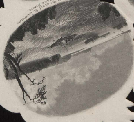
Junction of the Great St. Lawrence and Ottawa Rivers.