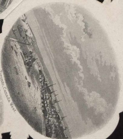
Toronto, Canada West.