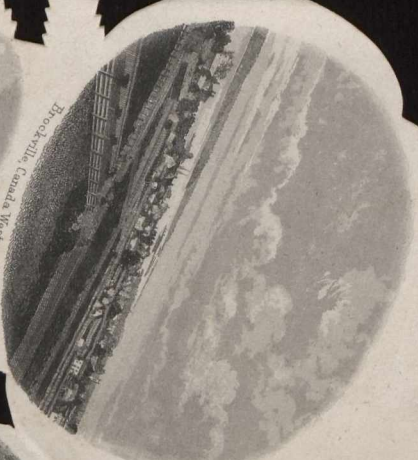
Brookville, Canada West.