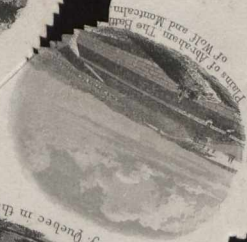
Pines of Wolf and Montcalm.