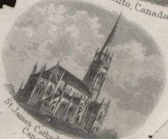
St. James' Cathedral, Toronto, Canada West.