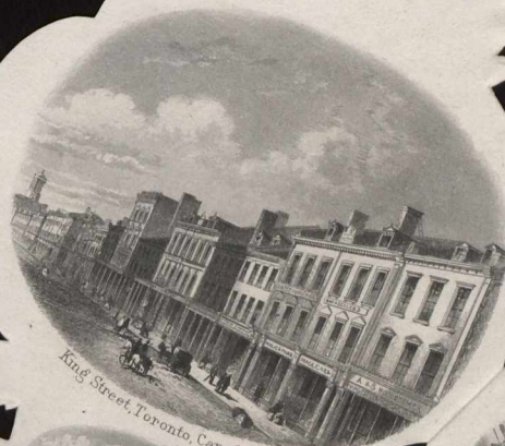
King Street, Toronto, Canada West.