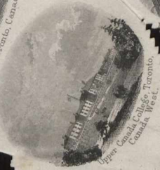
Upper Canada College, Toronto, Canada West.