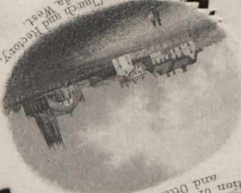
Ascopian Church and Rectory, London, Canada West.