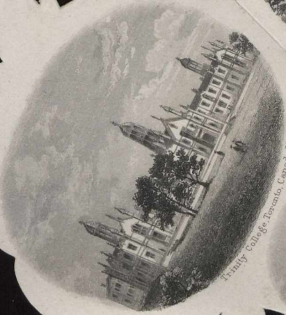
Trinity College, Toronto, Canada West.