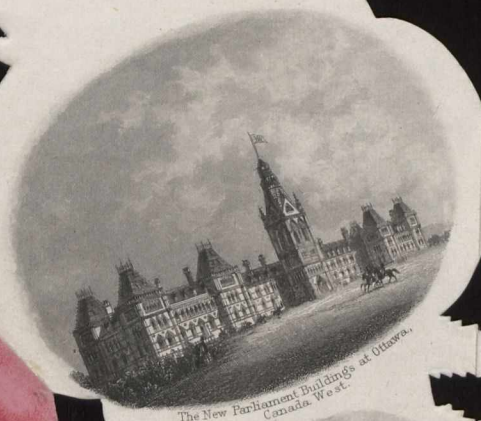
The New Parliament Buildings at Ottawa, Canada West.