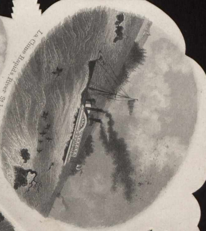
La Grosse Pointe, River St. Lawrence.