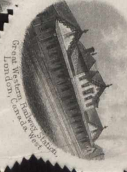
Great Western Railway Station, London, Canada West.

Allen Printing Establishment 1140 St. John St. Montreal