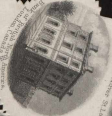
Bank of British North America, London, Canada West.

Allen Printing Establishment 1140 St. John St. Montreal