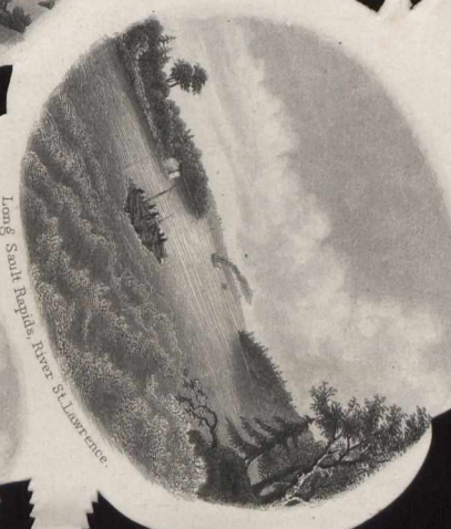
Long Sault Rapids, River St. Lawrence.