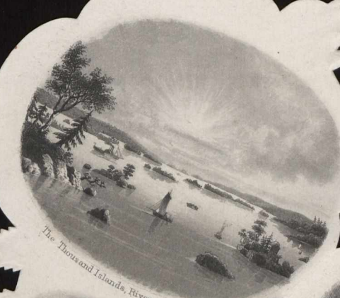
The Thousand Islands, River St. Lawrence.