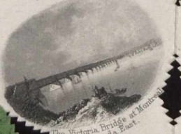
The Victoria Bridge at Montreal, Canada East.