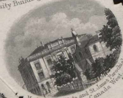
Mechanic's Institute and St. James' Episcopal School, Toronto, Canada West.