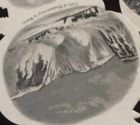
Falls of Montmorency in Winter.

LONDON, TORONTO, ST. CATHARINES, BROOKVILLE, AND BROOKVILLE, CANADA WEST.