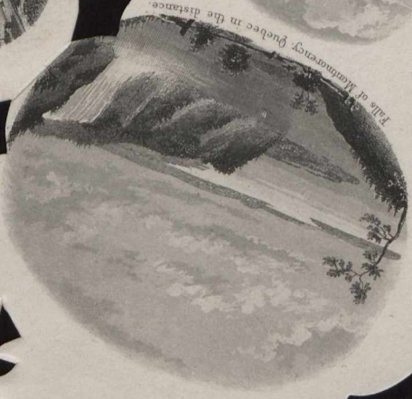
Falls of Montmorency, Quebec in the distance.