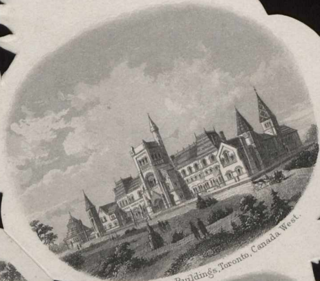
University Buildings, Toronto, Canada West.