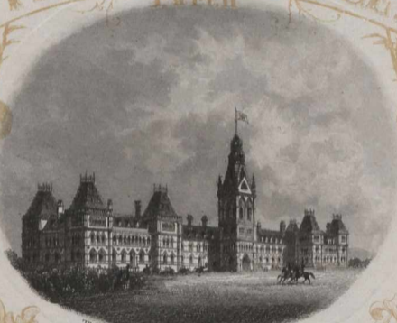
The New Parliament Buildings at Ottawa, Canada West.