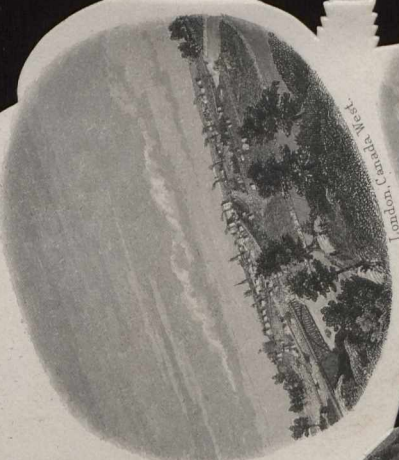
London, Canada West.