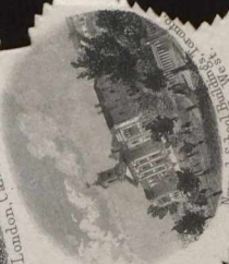
Normal School, Toronto, Canada West.