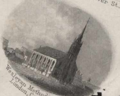
Wesleyan Methodist Church, London, Canada West.