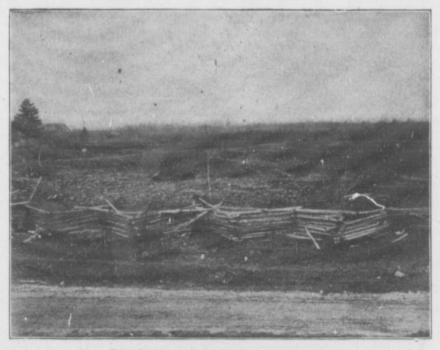
Example of an Ice-Reef. (See Report for 1896, p. 70.)

Here, as in the other townships, one of the most prominent physical features is the old shoreline markings. Their great height above present water levels suggests what a vast period of time has elapsed since the waters washed the highest parts of the hills. But there are evidences everywhere that they have done so at some remote time. The plan of the accompanying map is identical with that of the other township maps that I have lately issued. Four of the most important shorelines are marked, so as to give the altitudes of the different parts of the township. The "Algonquin" shoreline is taken as the base-line, and the other three shorelines are designated by their altitude above this one, viz., 110 feet, 230 feet, 310 feet, as it is the most important. The strong shoreline at 310 feet above the "Algonquin" is the highest one I have marked on the map, although there