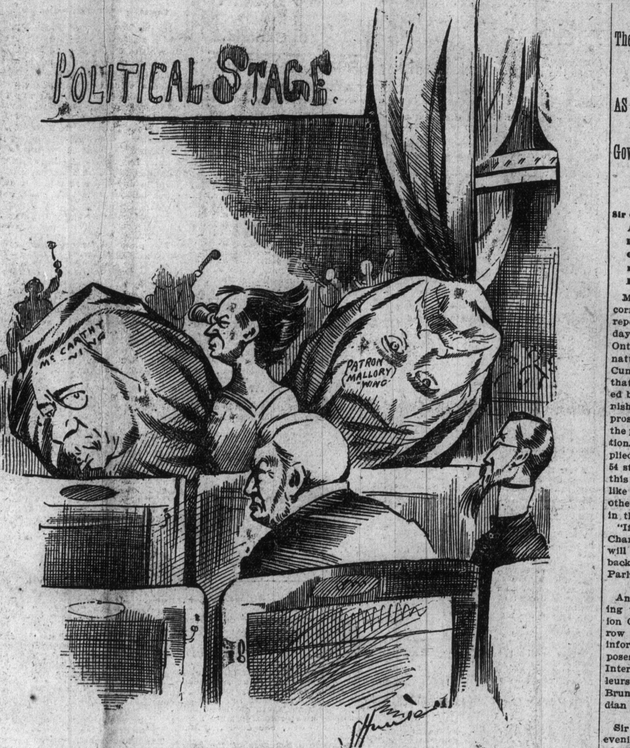
Gentlemen behind, in disguise: There certainly should be a law against that sort of thing.