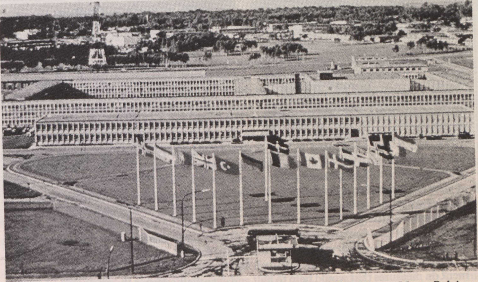
NATO today. Supreme Headquarters Allied Powers Europe (SHAPE) near Mons, Belgium.

Membership in NATO has been a major part of Canada's foreign policy for 30 years. NATO is both a collective/defence organization and a forum for political consultation. Successive federal govern-