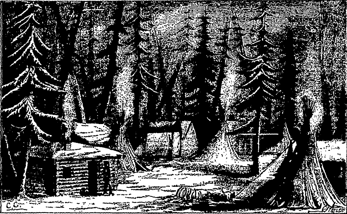
A BACKWOODS MISSION.

through the quiet influence of the Christian missionary. And yet the work of evangelizing the heathen has only been begun. For if to evangelize these masses is to clothe them with the hope of a blessed immortality, it is also to teach them to be kind and gentle in their life, and to change their lands from places of suffering and horror to the delightful scenes of Christian joy and peace.