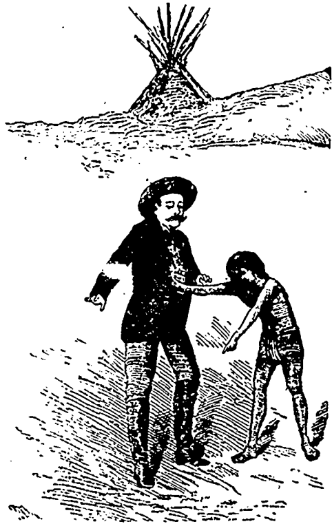
THE INDIAN BOY'S REVENGE.