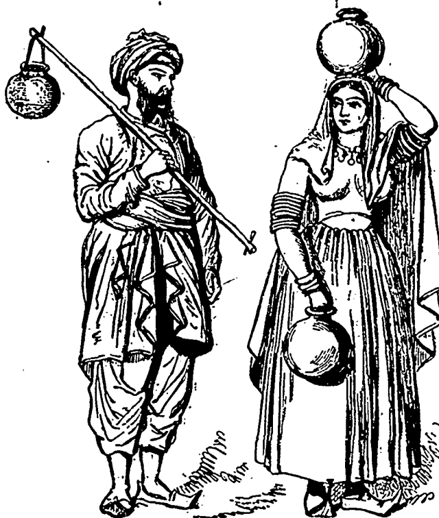
WATER CARRIERS OF INDIA.