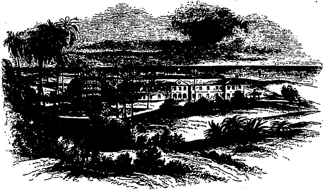
CODRINGTON COLLEGE, BARBADOS, W.I.

maintained there, all of them to be obliged to study phiscic and chirurgery as well as divinity."