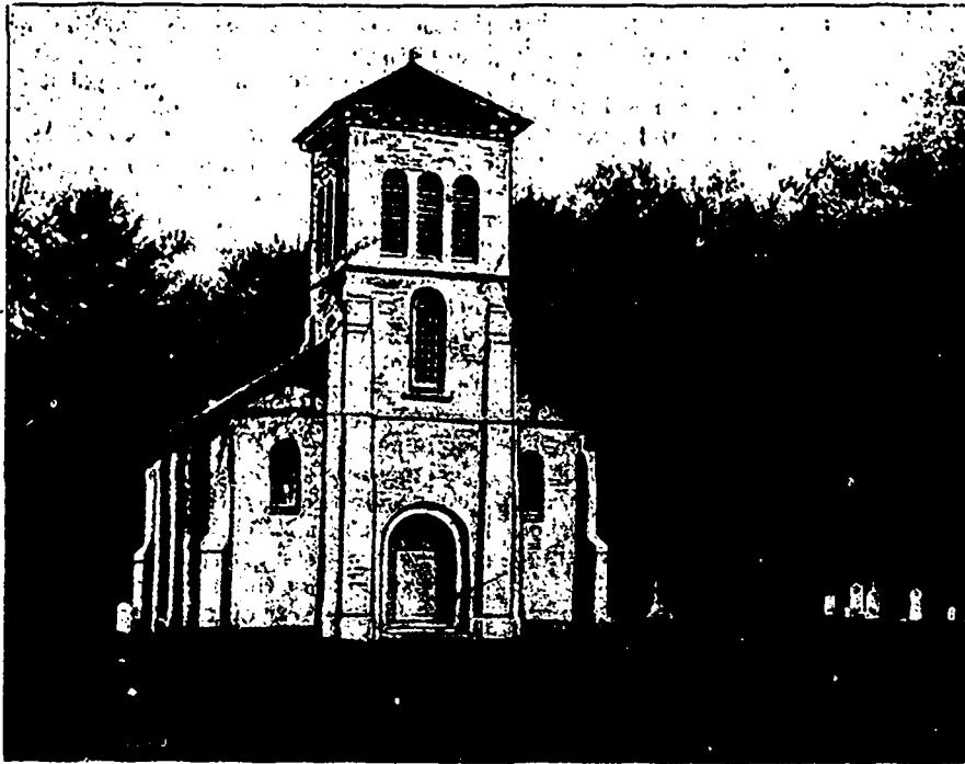
ST. THOMAS' CHURCH, SHANTY BAY.

to teach people to be selfish. The beautifying of the sanctuary, the building up of the Sunday school, the increasing the attractiveness of the choir and the general music for the congregation, the supporting the pastor himself, in fact, all such parochial objects, are worthy of the most prayerful attention of our people. But if they should be, even by implication, held forth as the only or even chief objects for Christian giving, it is hard to calculate the mischief that may be done.