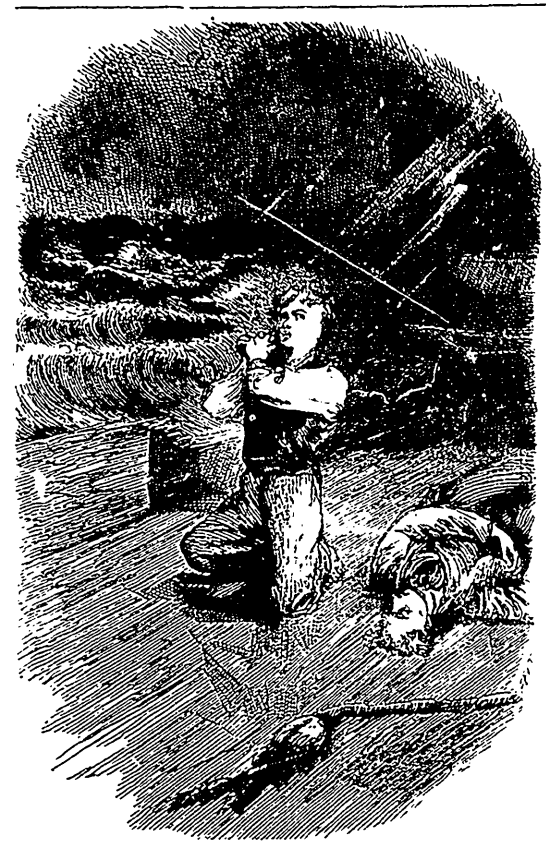
ON THE WRECK.

WO boys are on a wrecked ship. One has fainted through fear, the other is praying to the God of the seas for deliverance. Do any of you feel like laughing at that praying boy?