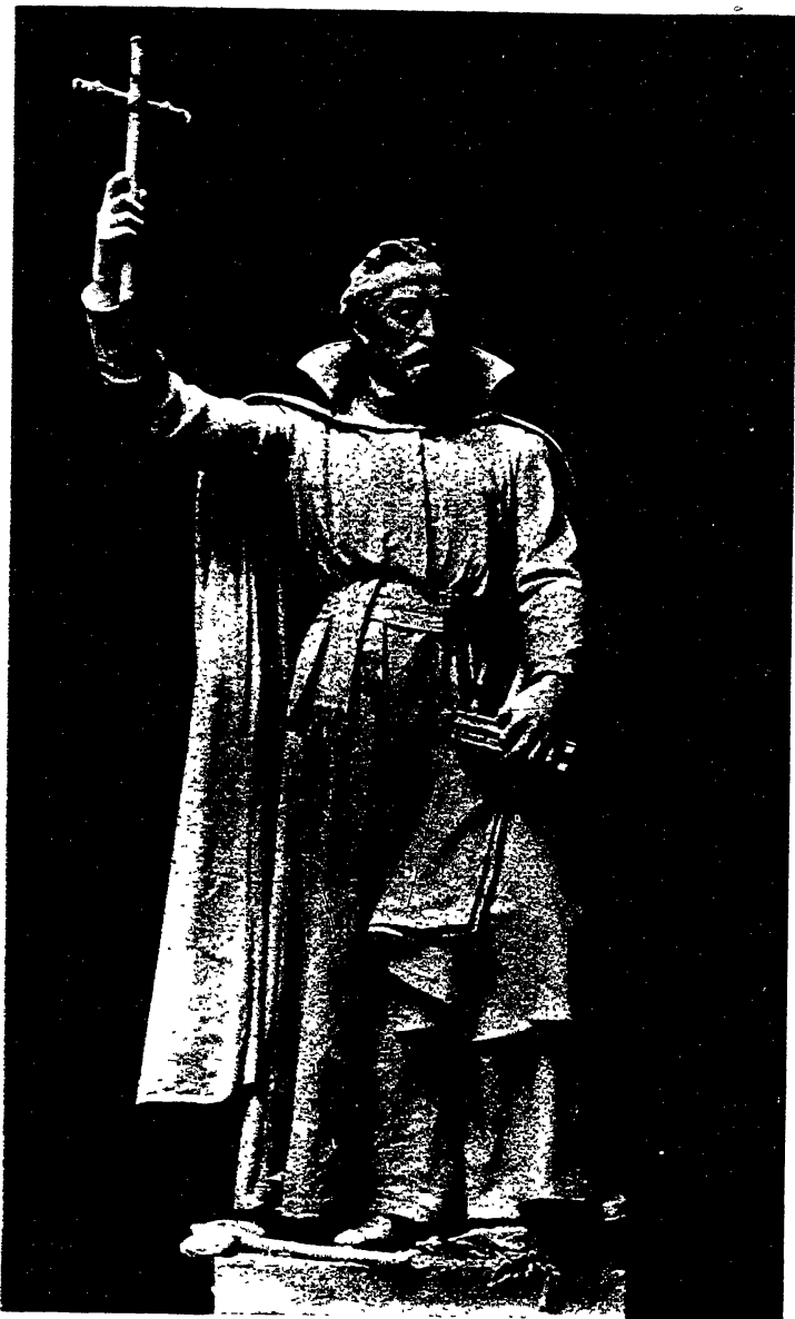
ISAAC JOGUES, S.J.