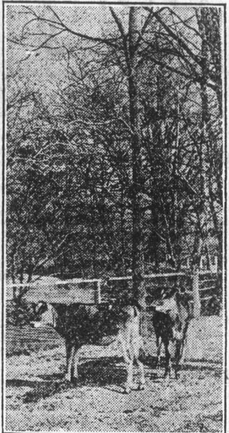
YOUNG BEEF STOCK.

The owner of a small farm who has equipped his place with a silo and established a field of alfalfa can profitably handle a carload of beef cattle every year. If he cannot breed so many on the place he is always able