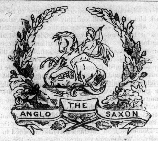
A Monthly Journal devoted to the interests of the Anglo-Saxon race in Canada.

OTTAWA, ONTARIO, CANADA, SEPTEMBER, 1888.