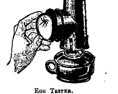
Showing a good fertile egg after five days of incubation.

These illustrations may be fully verified when testing the eggs during the process of incubator, by carefully breaking the shells and exposing the embryo to view on a