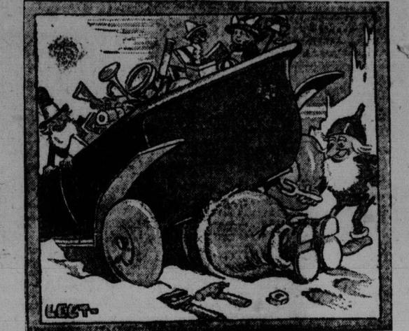
SANTA HAS TROUBLE WITH HIS AUTO. (NOTE TO CHILDREN—The Standard sent a reporter to Kris Kringle Land, to get the very latest Christmas news by wireless for YOU.)

Automobile Breaks Down the First Thing—Santa Gets Whiskers Caught in Machinery—Rescued by Brownies—Jack Frost Rushes Back for Reindeers.