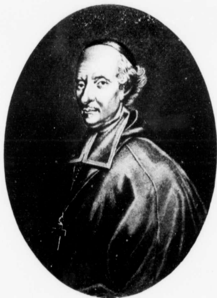
François de Sable