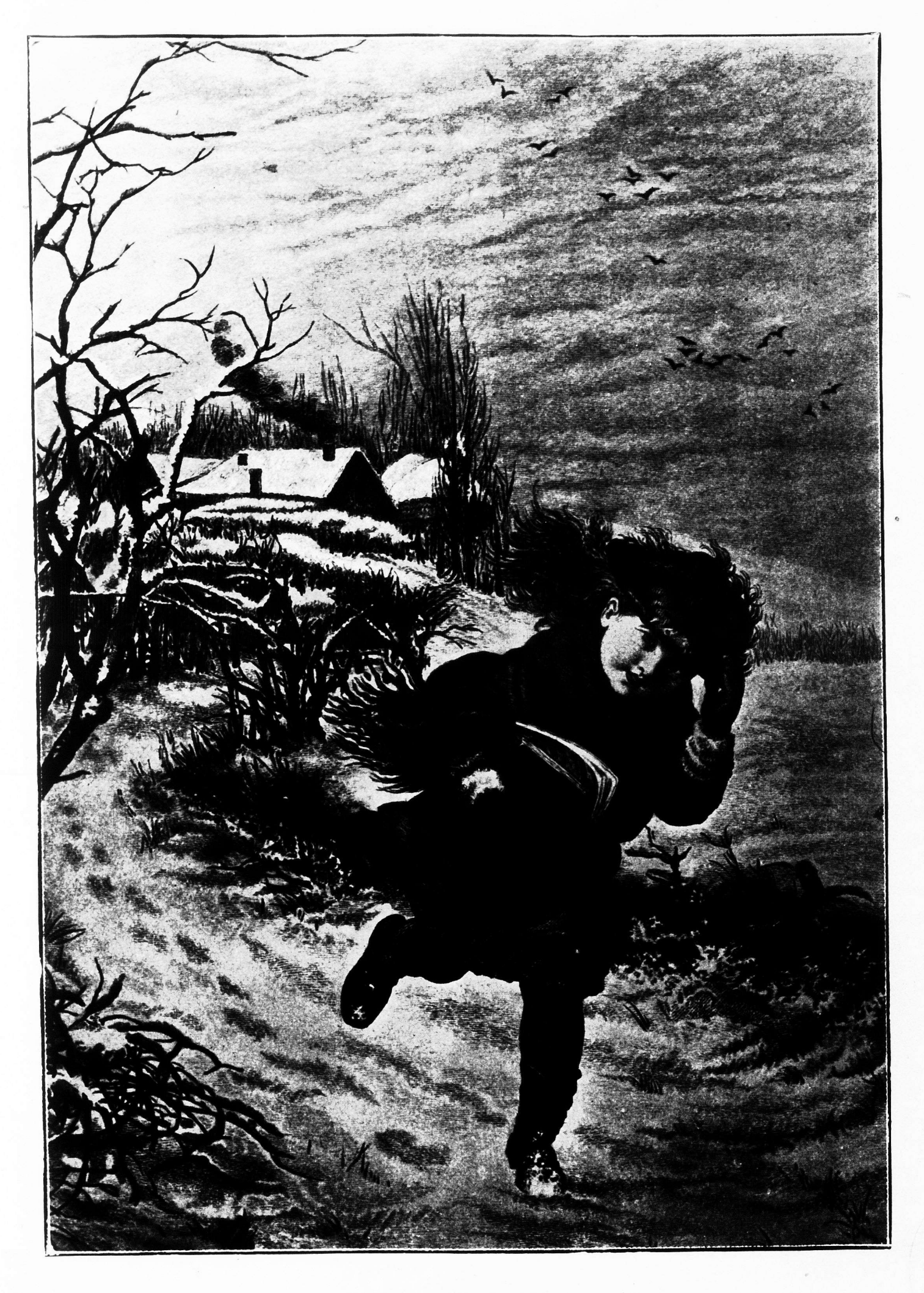
LATE FOR SCHOOL